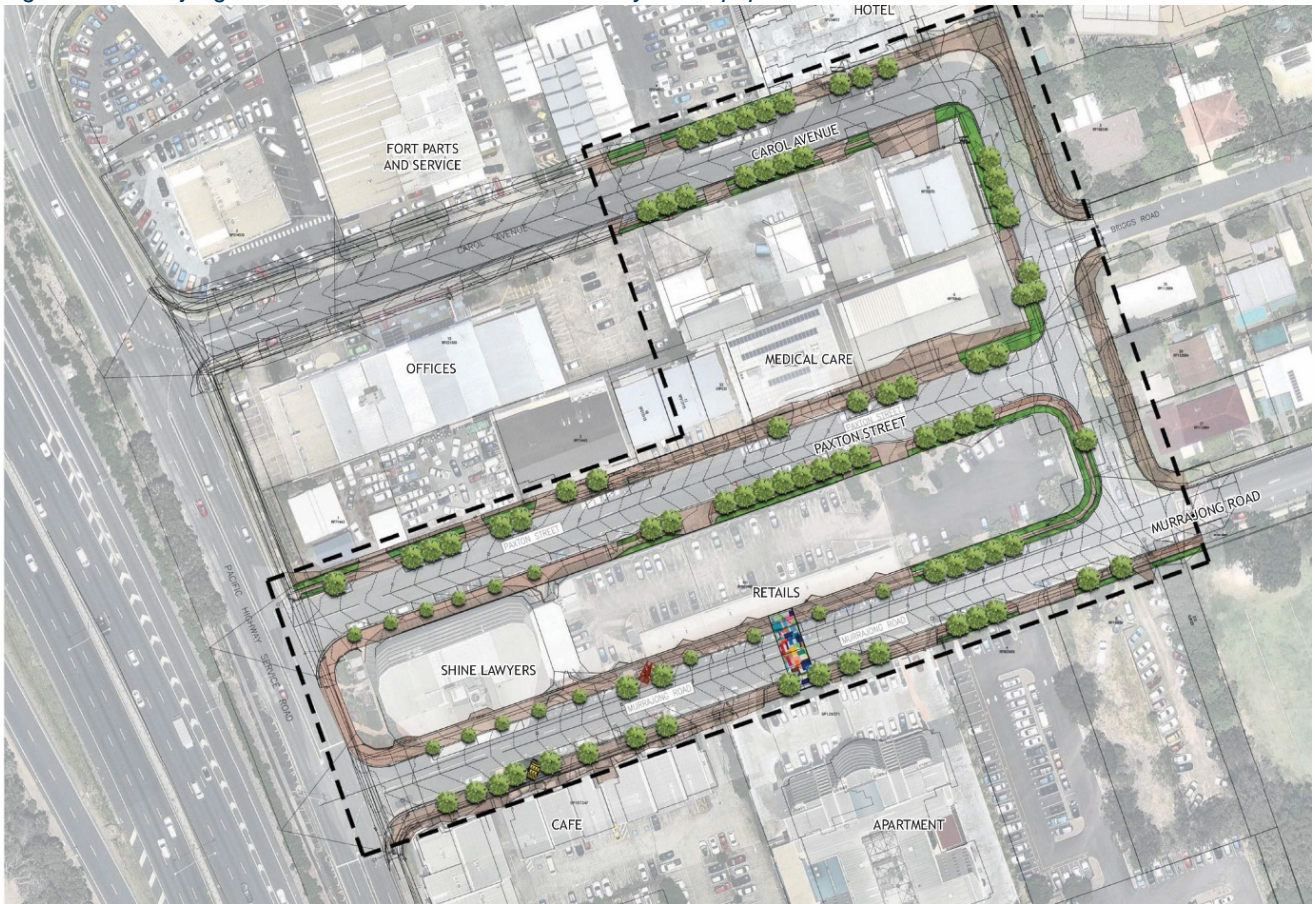
Figure 3 – Murrajong Road to Dennis Road Shared Pathway Concept plan